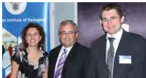
Click here for more photos

Christmas is upon us yet again, a time for family bonding, relatives visiting, catching up with friends, gift giving and over-indulging.