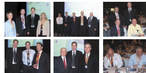
Click here to view conference images

The next National Conference will be held in Sydney in June 2008 so any feedback and ideas would be welcomed. Please email your comments to conference@aipack.com.au